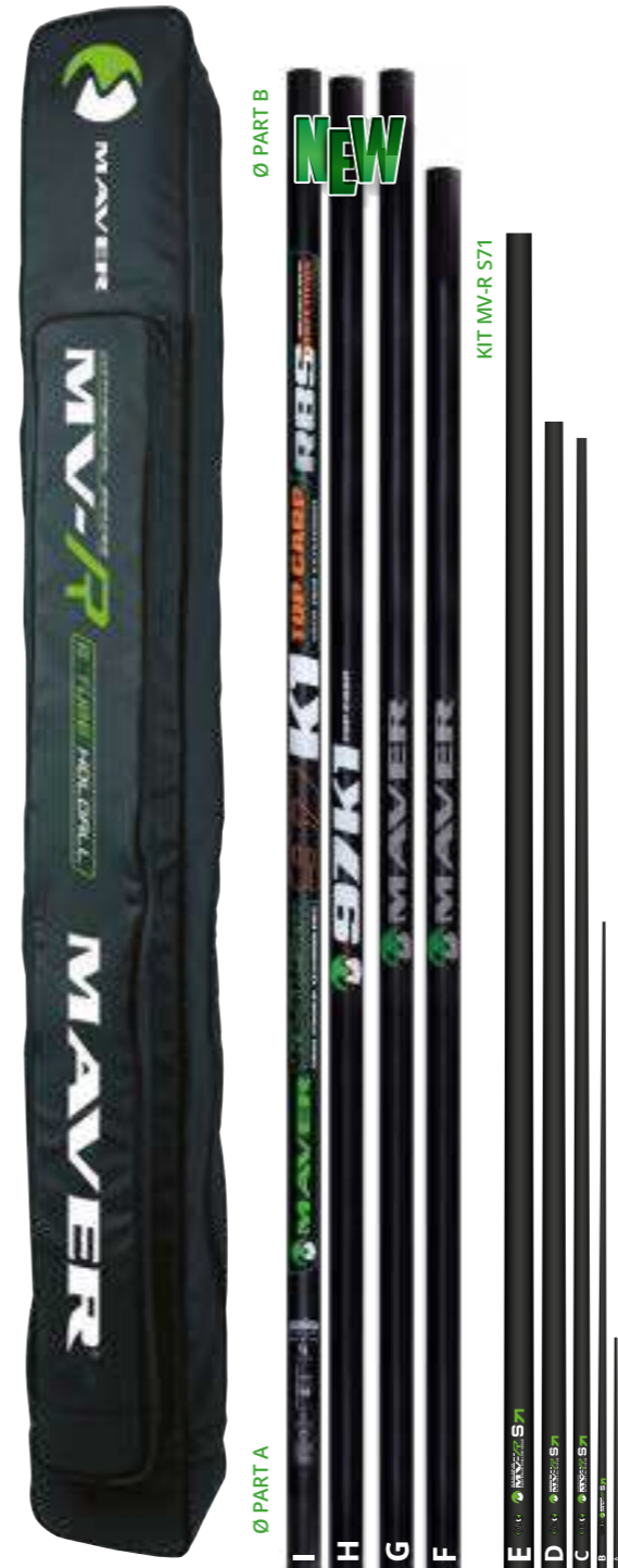
KIT MV-R S71