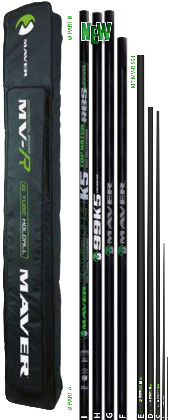
KIT MV-R S91